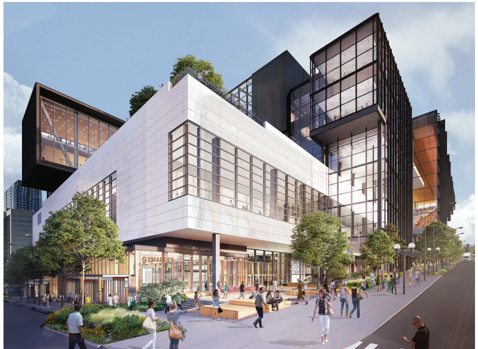
View of Summit looking northeast from Ninth and Pine

In the five years prior to start of construction, the Convention Center could not accommodate some 350 event proposals due to a lack of space or available dates, which cost our region an estimated $2.13 billion in potential revenue for local hotels, restaurants, cultural attractions and other hospitality businesses. The addition of Summit will double the Convention Center’s capacity to address Seattle’s growing event needs.